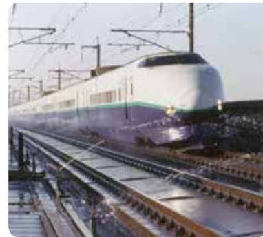
Joetsu Shinkansen ● Awards: Japan Society of Civil Engineers Outstanding Civil Engineering Achievement Award (1980), others