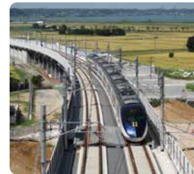
Narita Rapid Rail Access Line (Narita Sky Access Line) ● Awards: Japan Society of Civil Engineers Outstanding Civil Engineering Achievement Award (2010), others