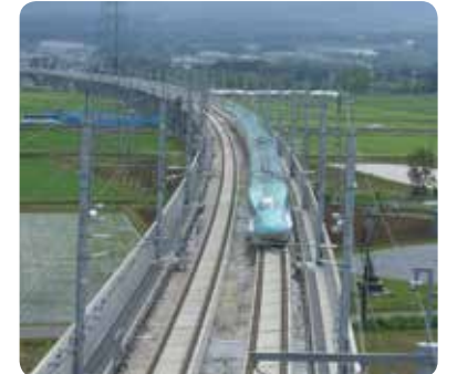
Tohoku Shinkansen ● Awards: Japan Society of Civil Engineers Outstanding Civil Engineering Achievement Award (2010), others