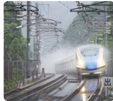
Hokuriku Shinkansen ● Awards: Japan Society of Civil Engineers Outstanding Civil Engineering Achievement Award (2015), others