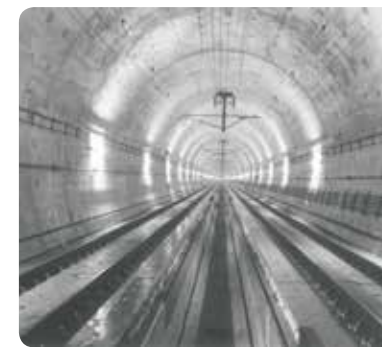
Tsugaru-Kaikyo Line (Seikan Tunnel) ● Awards: Commendation by the Prime Minister (1987), others