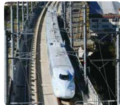
Kyushu Shinkansen ● Awards: Japan Society of Civil Engineers Outstanding Civil Engineering Achievement Award (2011), others

Over the 50-plus years since the establishment of the Japan Railway Construction Public Corporation (JRCC)—the predecessor to JRTT—in 1964, we have constructed a total length of roughly 3,640 km on 118 railways, including the Hokkaido Shinkansen between Shin-Aomori and Shin-Hakodate-Hokuto and other Shinkansen lines, the Tsugaru-Kaikyo Line, JR lines, private railways, and subways entrusted to us by local governments and others. Over that period, we have received many awards from domestic and international organizations alike.