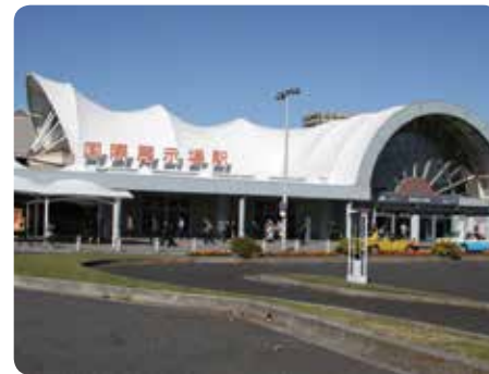
Rinkai Line ● Awards: Association of Railway Architects Ministry of Transport Railway Bureau Director-General Award (1996), others