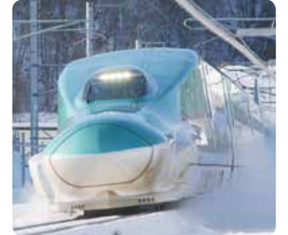
Hokkaido Shinkansen ● Awards: Japan Society of Civil Engineers Outstanding Civil Engineering Achievement Award (2012), others