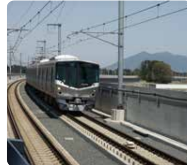
Tsukuba Express Line ● Awards: Universal Accessibility Excellence Award (2005), others