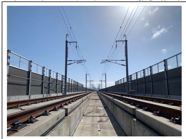
Interior view of viaduct (Fukui Prefecture)