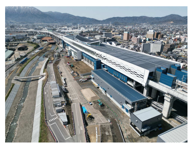
Exterior view of Tsuruga Station #1 (Fukui Prefecture)