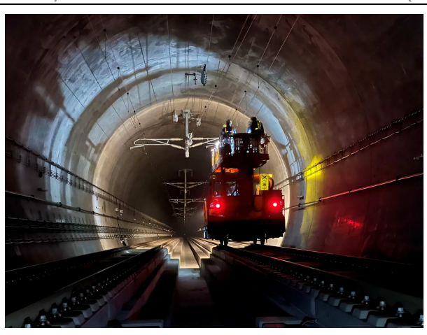
Interior view of Tunnel (Fukui Prefecture)